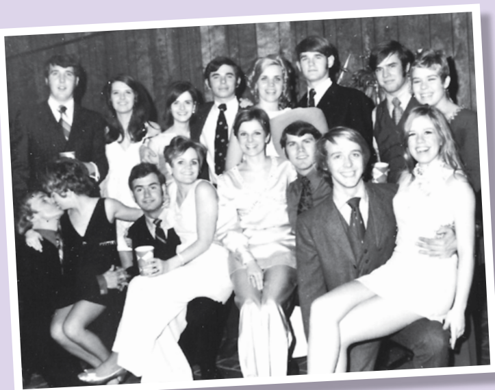
1971 WINTER FORMAL AT FOX DEN