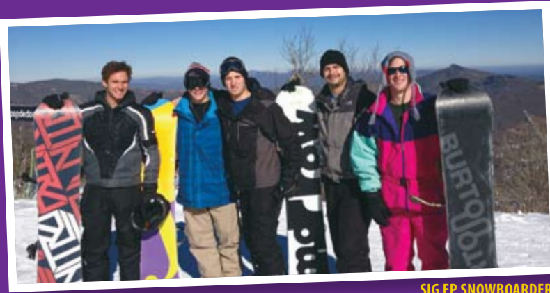
SIG EP SNOWBOARDERS

The chapter received an Excelsior Award for recruitment at this year's Carlson Leadership Academy in Atlanta.