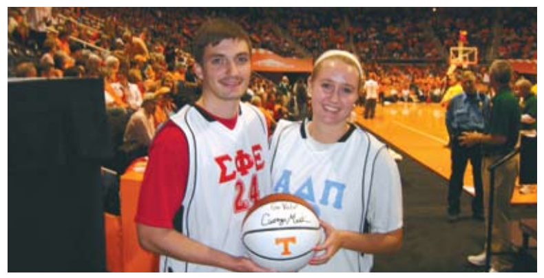
3-POINT BASKETBALL "SHOOT FOR THE CURE"