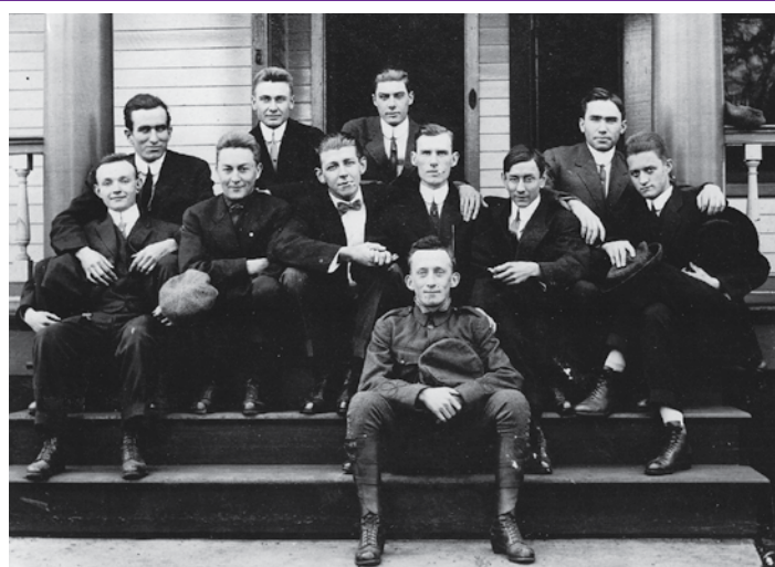
1913 - Founder's relax on front porch