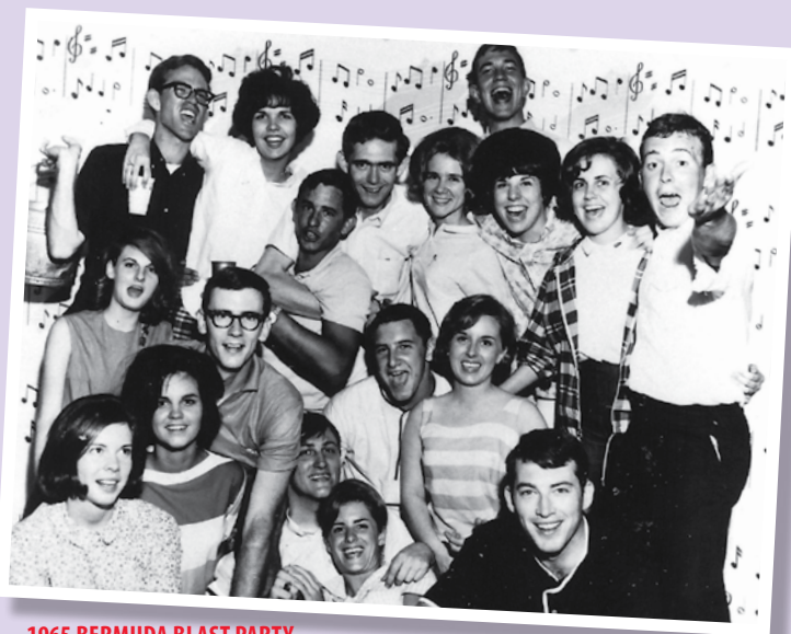
1965 BERMUDA BLAST PARTY