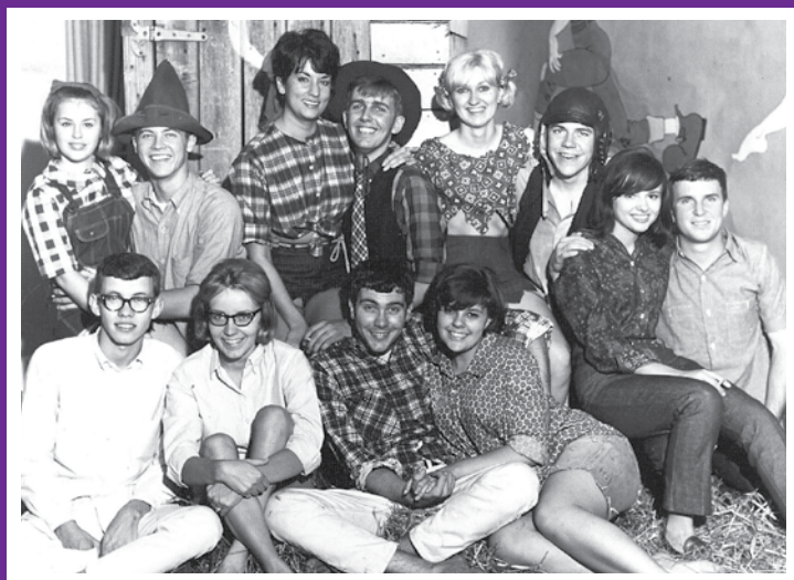
1965 DOG PATCH PARTY