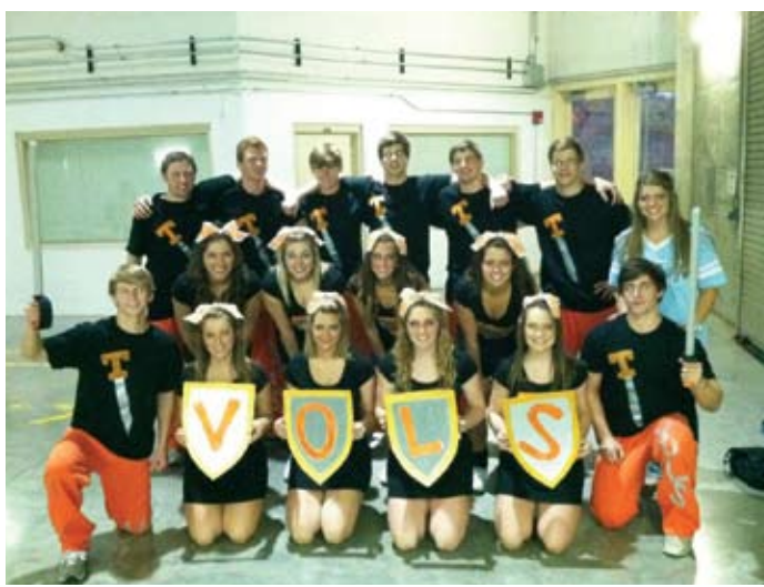
SMOKEY'S HOWL COMPETITION